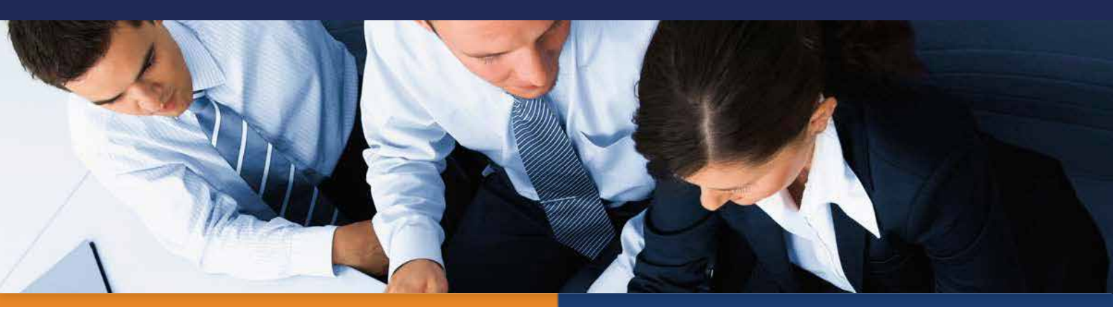
Fitness 4 Home Relies on KEO Marketing's Online Marketing Solutions to Drive Web and Foot Traffic Sales